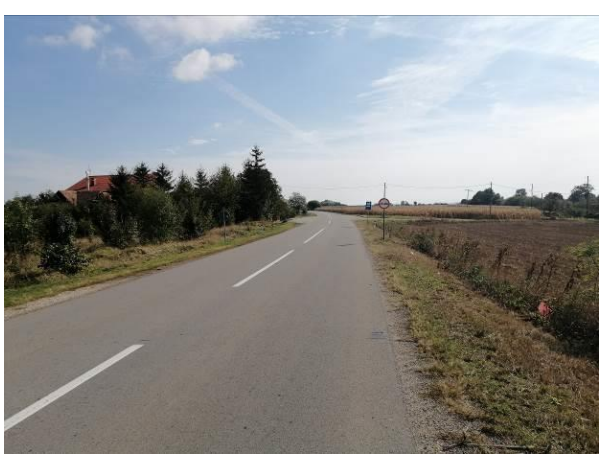
Figure 2-1 Typical road section landcape

During the road section survey 4 retaining walls were noted.