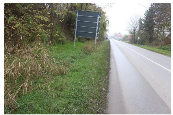
Figure 2-35 km ~20+000 the ditch covered in vegetation

The following figures show the condition of the existing ground ditches: