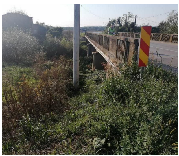
Figure 2-27 The bridge over the Suvi Potok river