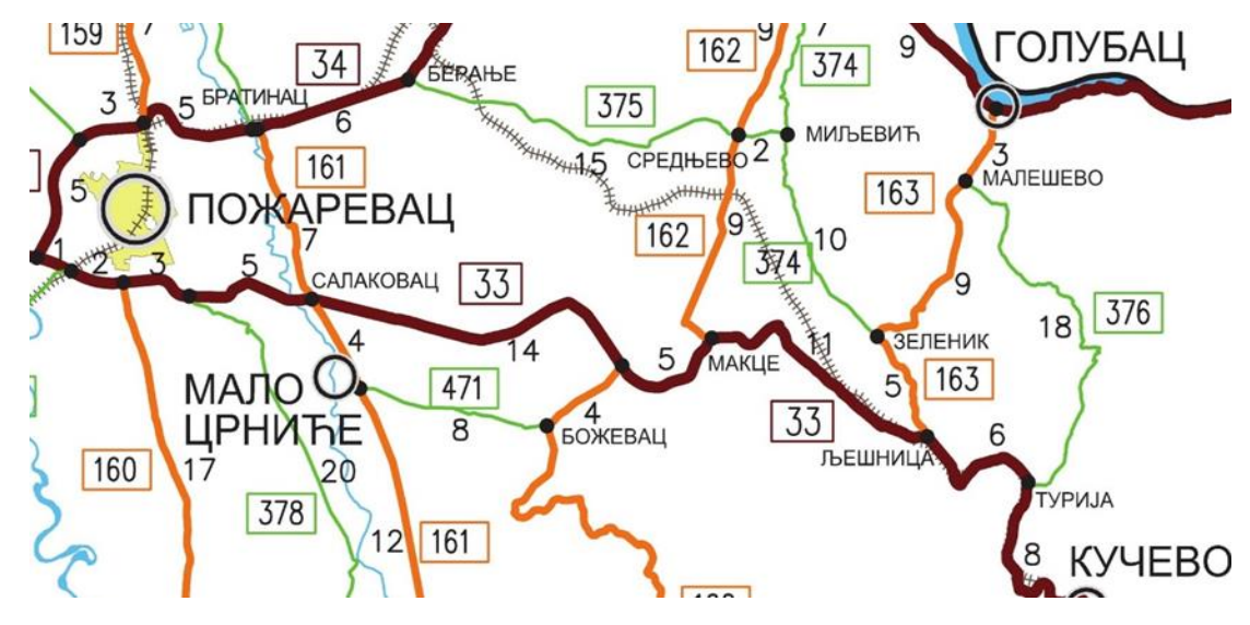
Figure 1-1 The position of the subject road section within the state Reference Road System of the Republic of Serbia from 2017