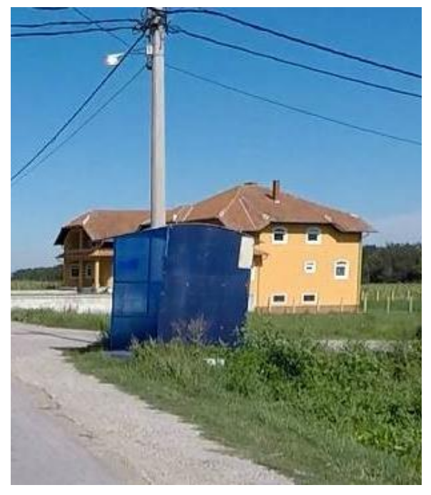
Figure 2-6 Bus stop, Mustapic, at km 51+440