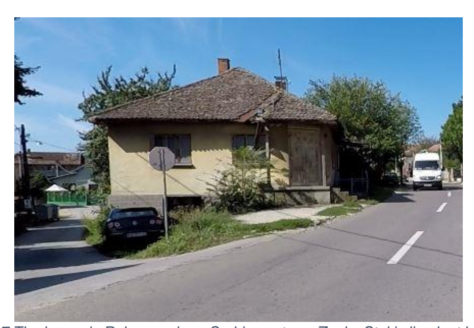
Figure 2-17 The house in Rabrovo where Serbian actress Zanka Stokic lived, at km 47+090

During the road section survey, the house in which the actress Zanka Stokic lived in Rabrovo was recorded, in front of which there is a plaque with an inscription. The house is in a dilapidated condition.