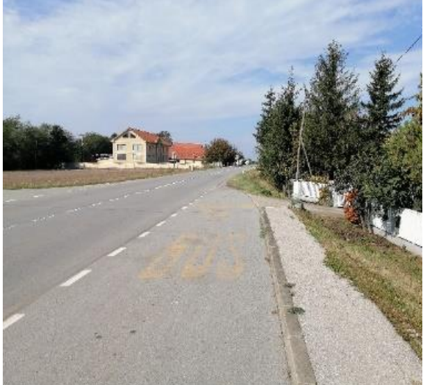
Figure 2-5 Bus stop, on the left and right side of the road, at km 40+477