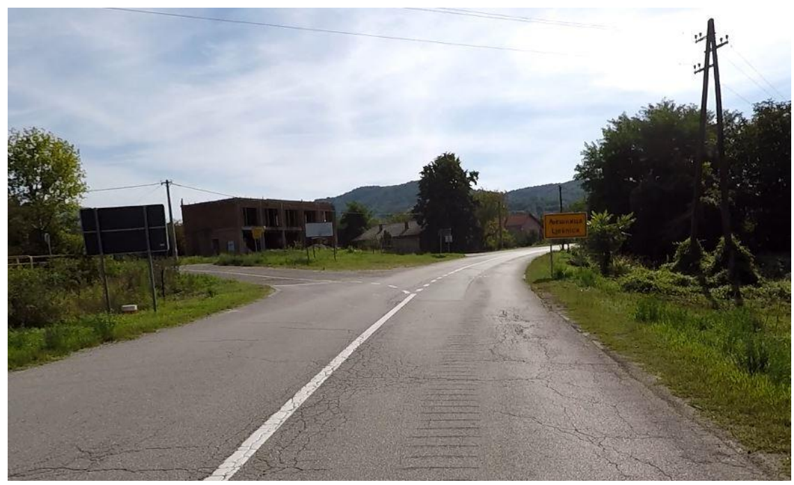
Figure 1-4 The end of the subject section