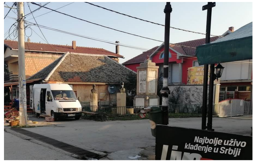
Figure 2-16 The monument to the fighters in the Second WW, in Rabrovo, at km 47+263

During the road section survey, the house in which the actress Zanka Stokic lived in Rabrovo was recorded, in front of which there is a plaque with an inscription. The house is in a dilapidated condition.