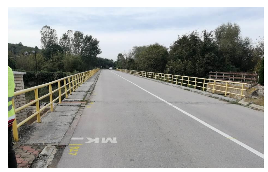
Figure 2-30 The bridge over the Pek river

The Terms of Reference recommend the regulation of watercourses in the following places: