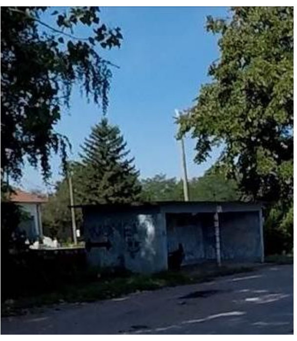
Figure 2-7 Bus stop, Misljenovac, at km 53+485