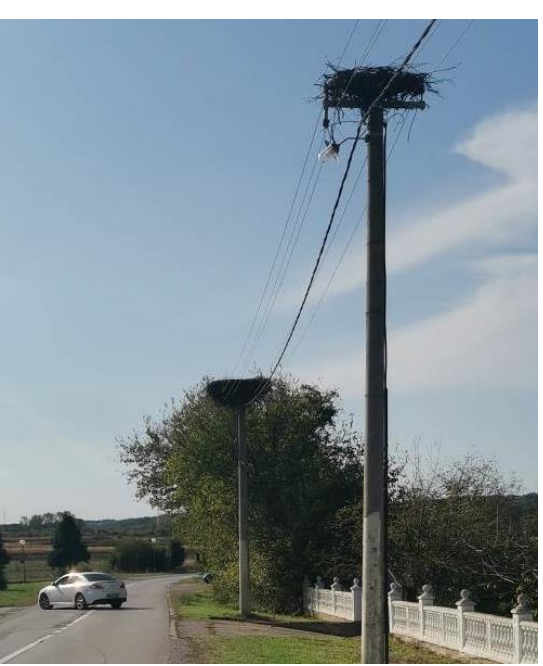
Figure 2-23 Misljenovac, stork nests on two consecutive lighting poles, at km 53+235 u km=53+258