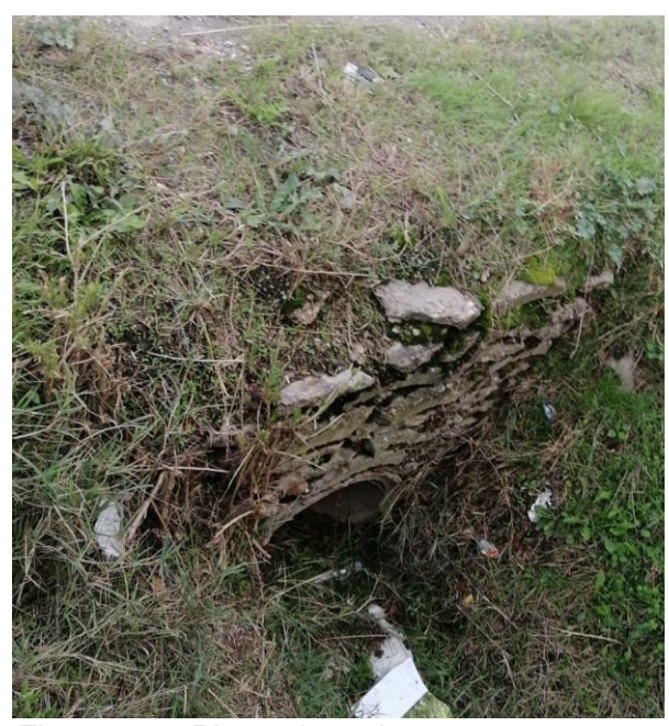
Figure 2-32 Pipe culvert, km 42+431