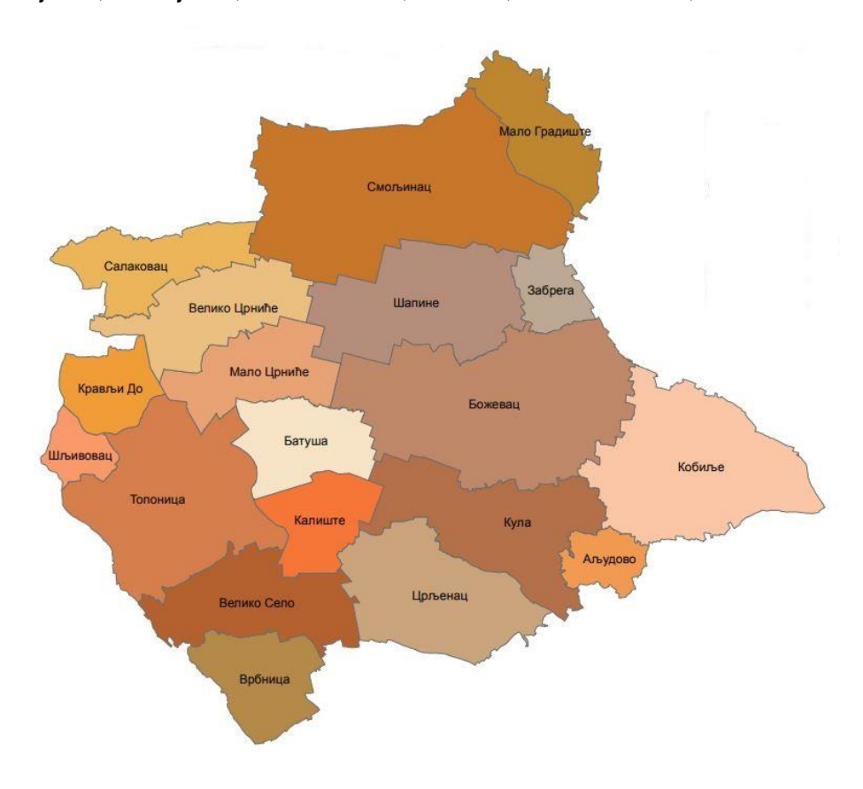
Figure 2-13 Settlements of Veliko Gradiste municipality

The settlements of Malo Crnice municipality are: Aljudovo, Kobilje, Zabrega, Malo Gradiste, Vrbnica, Toponica, Veliko Selo, Kula, Crljenac, Kaliste, Sljivovac, Bozevac, Sapine, Smoljinac, Kravlji Do, Malo Crnice, Batusa, Veliko Crnice, and Salakovac.