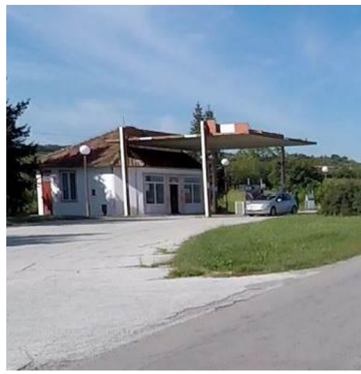
Figure 2-11 Gas station in Misljenovac, at km 53+185