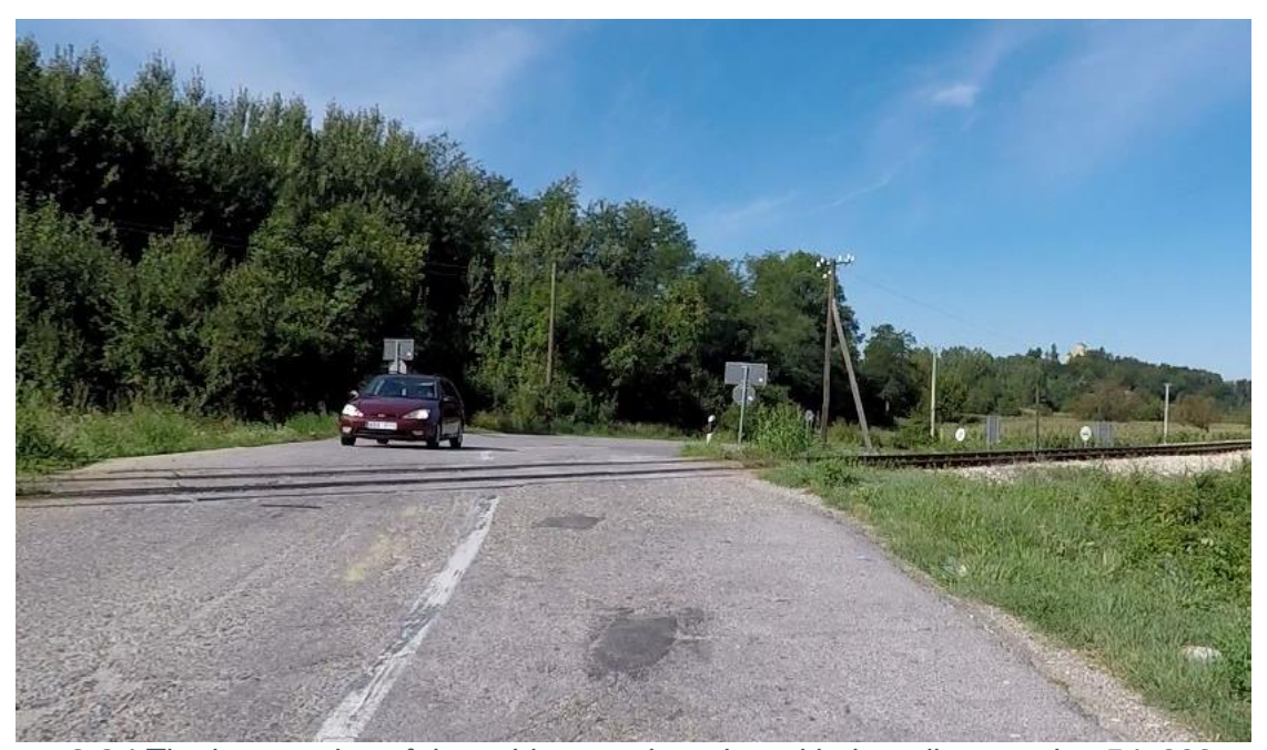
Figure 2-24 The intersection of the subject road section with the railway, at km 54+339

A railway runs parallel with a part of the subject road section from Rabrovo to Misljenovac. The intersection of the railway with the subject road section is located between Misljenovo and Ljesnica, at km 54+339