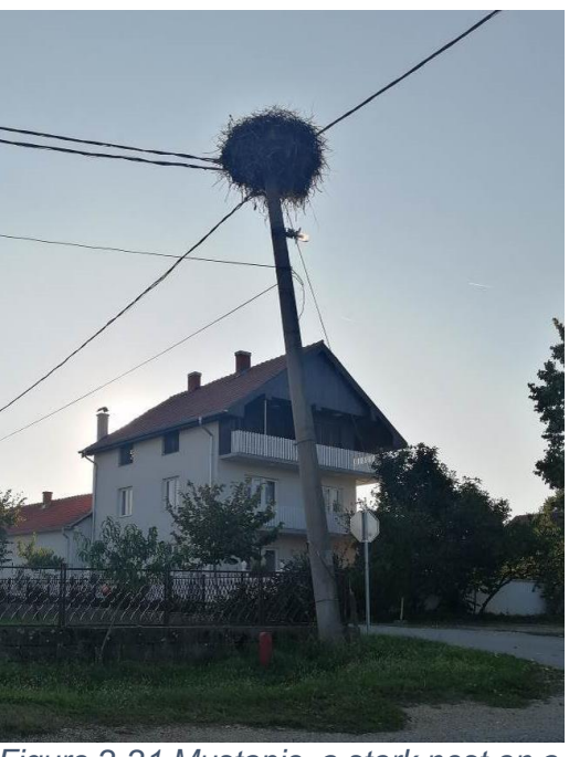
Figure 2-21 Mustapic, a stork nest on a public lighting pole, at km 50+970