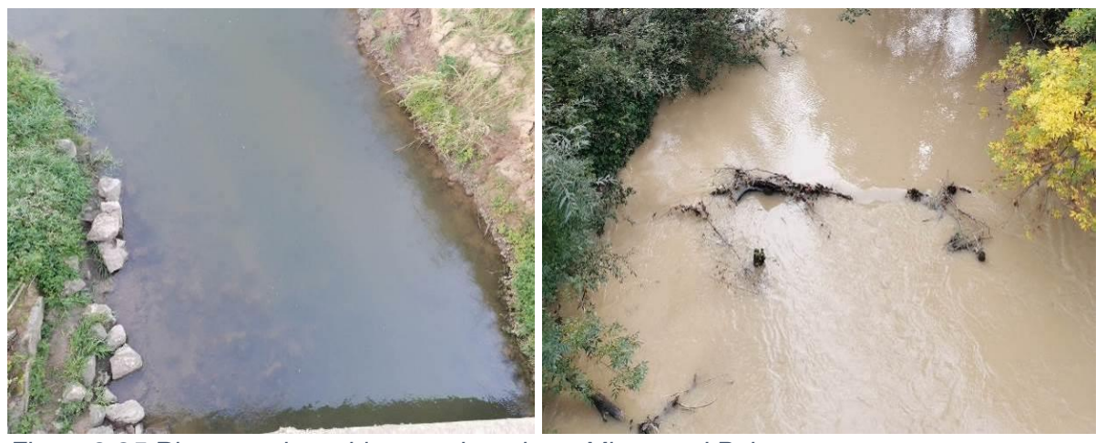
Figure 2-25 Rivers on the subject road sections, Mlava and Pek

The subject road section is crossed by two rivers: Mlava and Pek. The river Mlava intersects the road section near Salakovac, while the Pek intersects the road section just before its completion, before entering Ljesnica from Pozarevac direction.