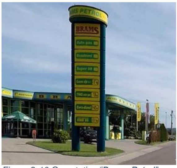
Figure 2-10 Gas station "Brams Petrol", Rabrovo, at km 46+282