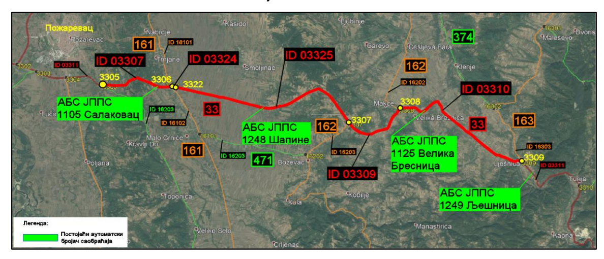
Слика 2-31 Locations of the existing automatic traffic counters and section marks

Data on the daily traffic of these sections were collected in the phase of exploration works. Data collection by control automatic traffic counting was done continuously for 7 days, in both traffic lanes simultaneously. Following the accepted traffic counting plan, additional manual counts of pedestrians and cyclists, as well as motor vehicles were done at 3 locations on the subject section.