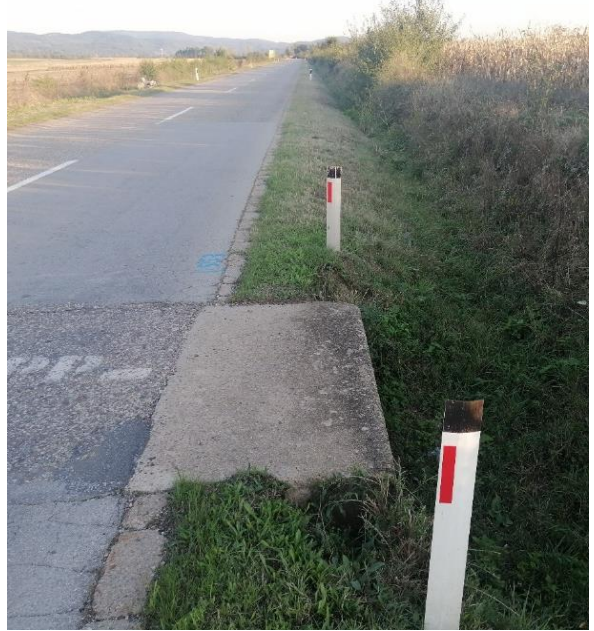
Figure 2-33 Box culvert and canal, km 48+495