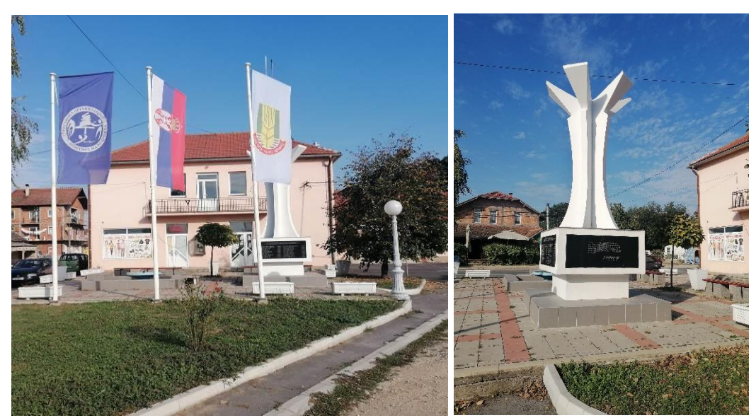
Figure 2-15 The monument to the killed fighters in the Second WW, Salakovac, at km 24+680

During the road section survey, a monument to the fighters in the Second World War was recorded, which is located in Salakovac, at the approximate chainage 24 + 680.