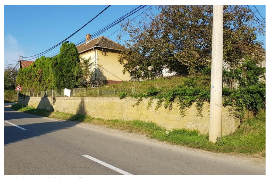
Figure 2-2 Retaining wall No 3, Rabrovo

The following economic facilities and contents were identified along the observed road section: