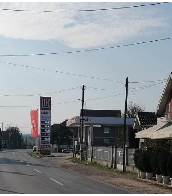
Figure 2-9 Gas station "Lukoil", Salakovac, at km 24+410