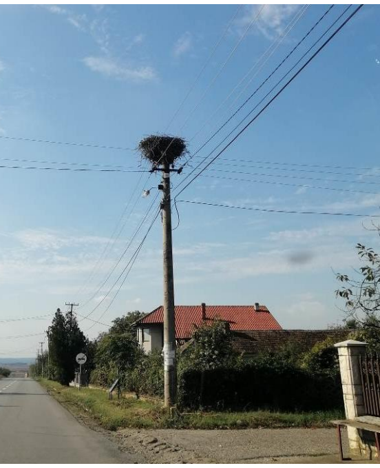
Figure 2-19 Sapine, a stork nest on a public lighting pole, at km 32+000