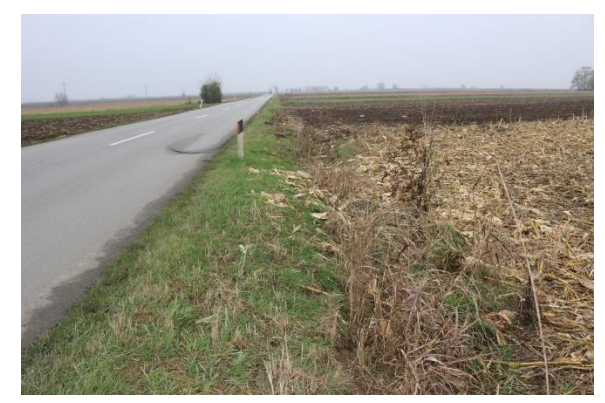
Figure 2-36 km ~25+500 irregular-shaped ditch, covered in vegetation, further it is turned into arable land