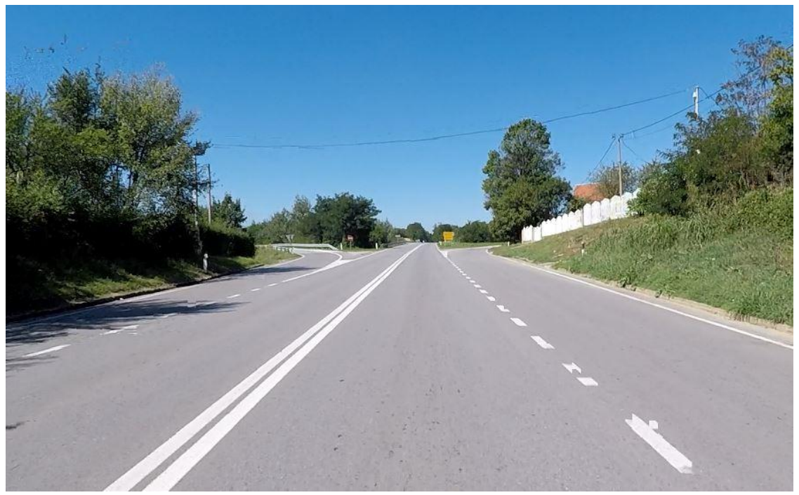
Figure 1-3 The beginning of the subject road section