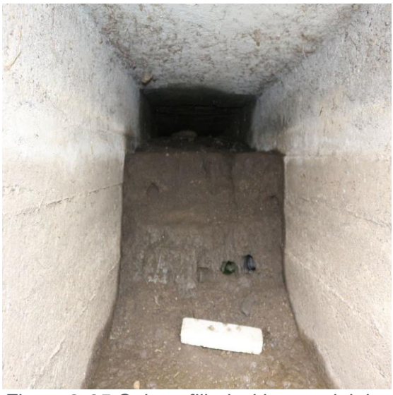
Figure 2-35 Culvert filled with material, km 31 +151

The ditches are covered by vegetation on almost the entire stretch and are inadequately shaped. They do not have continuity and are cut by frequent approaches for agricultural vehicles, country roads, and crossroads. One of the most important remarks when assessing the culvert state referred to the need to clean and arrange the surrounding terrain to ensure the smooth functioning of the culvert.