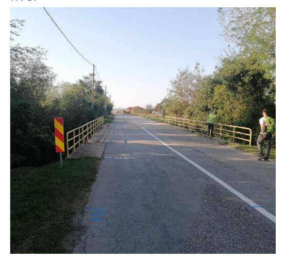
Figure 2-28 The bridge over a dry, deep obstacle