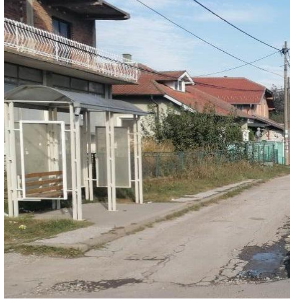
Figure 2-3 Bus stop, Salakovac, at km 24+631