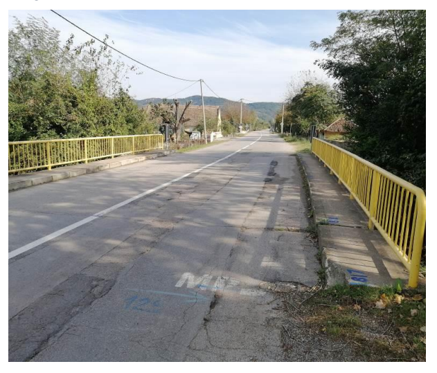
Figure 2-29 The bridge in Misljenovac