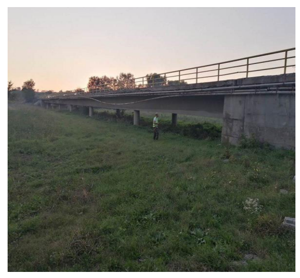
Figure 2-26 The bridge over the Mlava river