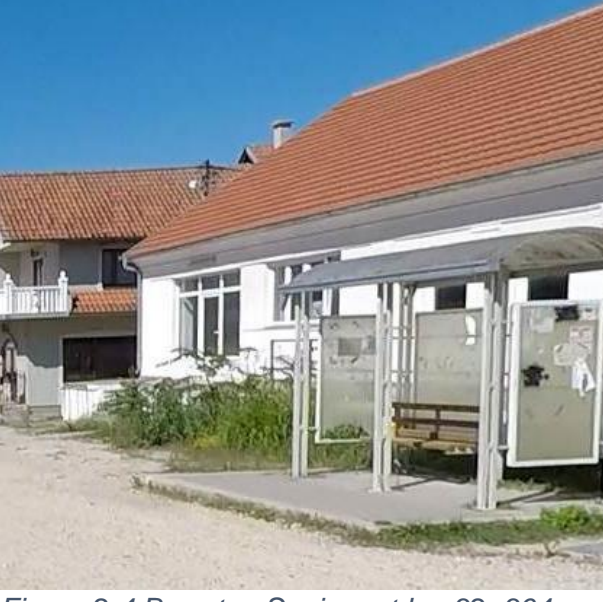
Figure 2-4 Bus stop Sapine, at km 32+364