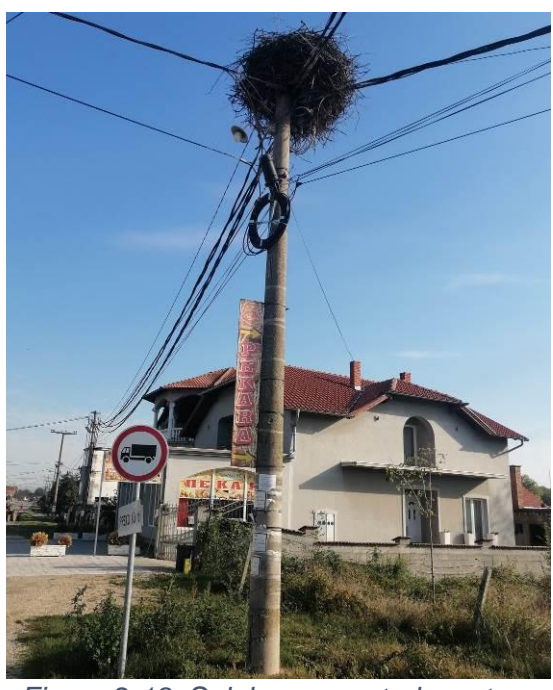
Figure 2-18 Salakovac, a stork nest on a public lighting pole, at km 24+645