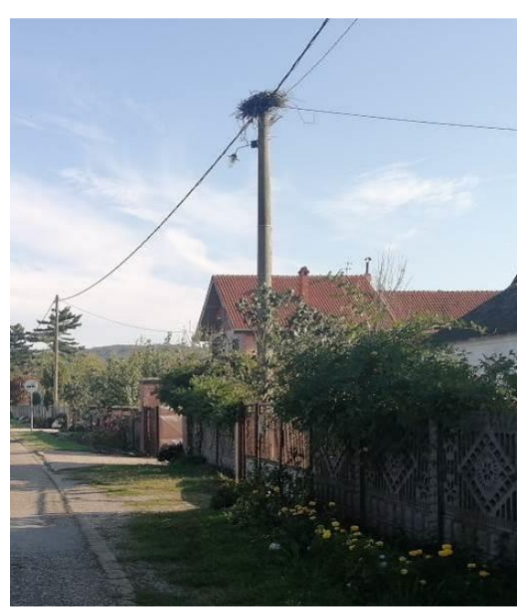
Figure 2-22 Mustapic, a stork nest on a public lighting pole in a frontyard, at km 51+756