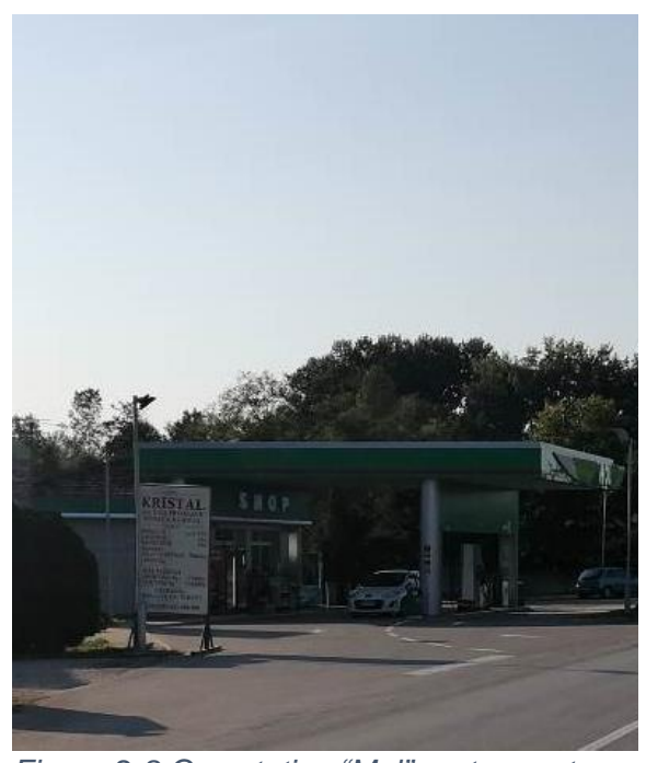
Figure 2-8 Gas station "Mol", entrance to Salakovac, at km 23+053