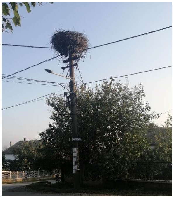
Figure 2-20 Rabrovo, a stork nest on a public lighting pole, at km 47+861