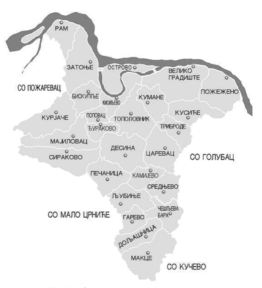
Figure 2-14 Settlements of Veliko Gradiste municipality

The trunk road Belgrade-Kladovo and the railway pass through the southern part of the municipality. It is about 110 km, an hour's drive, away from Belgrade. Veliko Gradiste is connected with other surrounding cities by good asphalt roads.